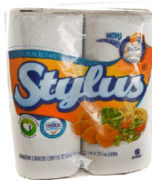
PAP TOALHA STYLUS C/2