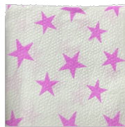
GUARD 19,5X19,5 ESTRELA BR/ROSA C/50