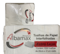
PAP INTERFOLHA EXTRA LUXO ALBAMAX C/1000