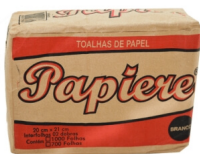
PAP INTERFOLHA BRANCO