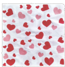
GUARD 19,5X19,5 CORACAO BR/VERM C/50