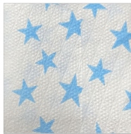
GUARD 19,5X19,5 ESTRELA BR/AZ C/50