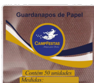
GUARD 30X33 MARROM C/50