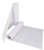
LENCOL HOSPITALAR 50X70