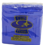
GUARD 30X33 AZUL ESCURO C/50