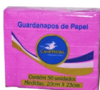
GUARD 20X23 PINK C/50