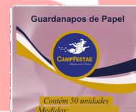
GUARD 30X33 LILAS C/50