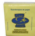
GUARD 30X33 AMARELO C/50