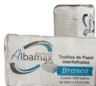
PAP INTERFOLHA BRANCO ALBAMAX C/1000