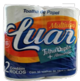
PAP TOALHA LUAR C/2