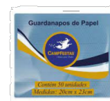
GUARD 20X23 AZUL CLARO C/50