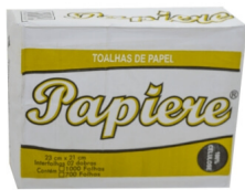
PAP INTERFOLHA 100% CELULOSE