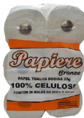
PAP INTERFOLHA BOB 6X200MT