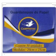
GUARD 20X23 AZUL ESCURO C/50