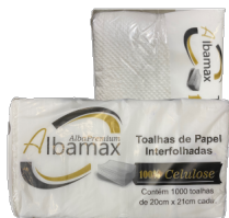
PAP INTERFOLHA 100% CELULOSE ALBAMAX C/1000