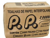
PAP INTERFOLHA BR LUXO C/1000