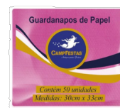
GUARD 30X33 ROSA C/50