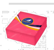
GUARD 30X33 PINK C/50